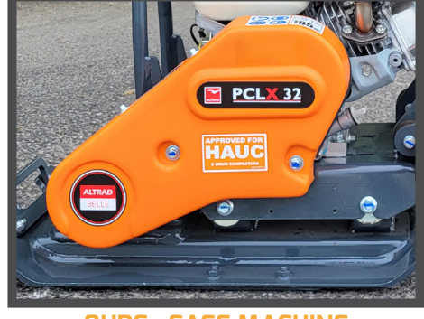
8HRS+ SAFE MACHINE