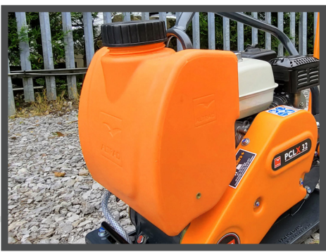
12 LTR QUICK-RELEASE WATER TANK